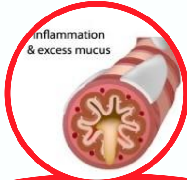
Acute & Chronic Bronchitis