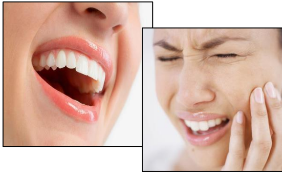
Useful for Teething Pain and Act as Mouth Freshener