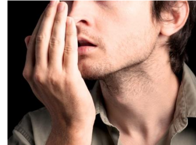
Useful for Bad Breath