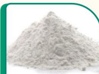
Shuddha Tankan Powder