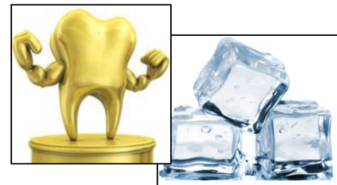
Useful for Strengthen Teeth and act as Cooling Agent