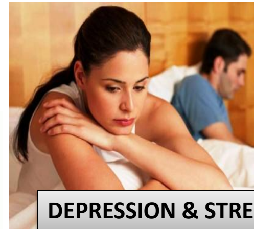
DEPRESSION & STRESS