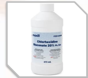
Gluconate Solu. (20 % w/v)