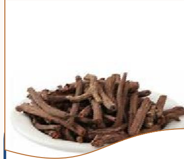
Revand Chini root

This herb commonly known as Indian Madder, is one of Ayurveda's most popular herb for blood purification. It brightens the complexion of the body.